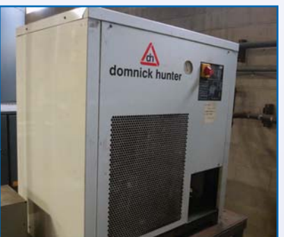
DOMNICK HUNTER AIR DRYER