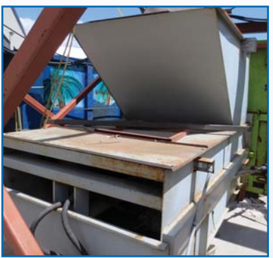
HYDRA PAK 1500 COMPACTOR