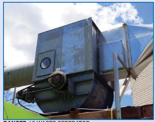
DANSEP 12 WASTE SEPERATOR