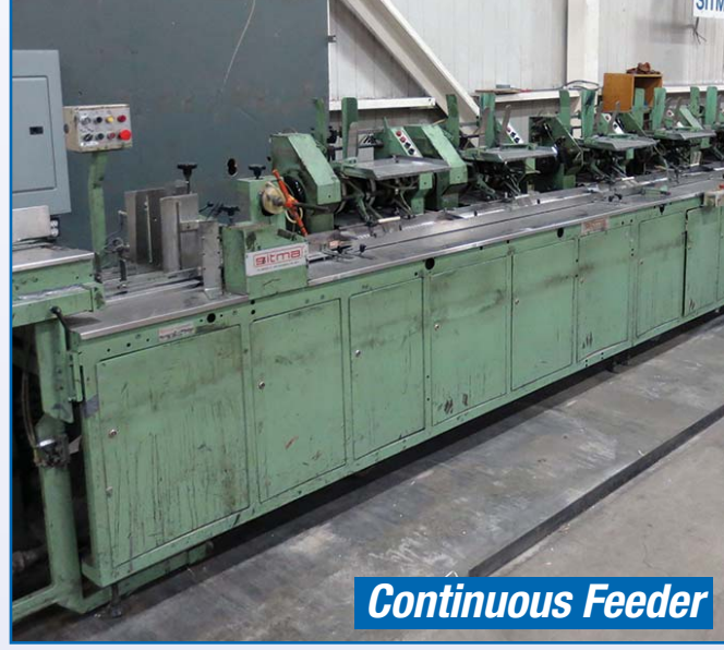
SITMA C80-750 POLYBAGGING LINE