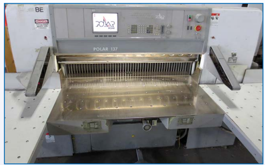
2000 POLAR 137ED 54" PROGRAMMABLE PAPER CUTTER