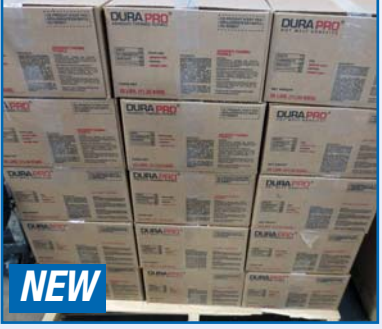
DURA PRO HOT MELT RAW MATERIAL