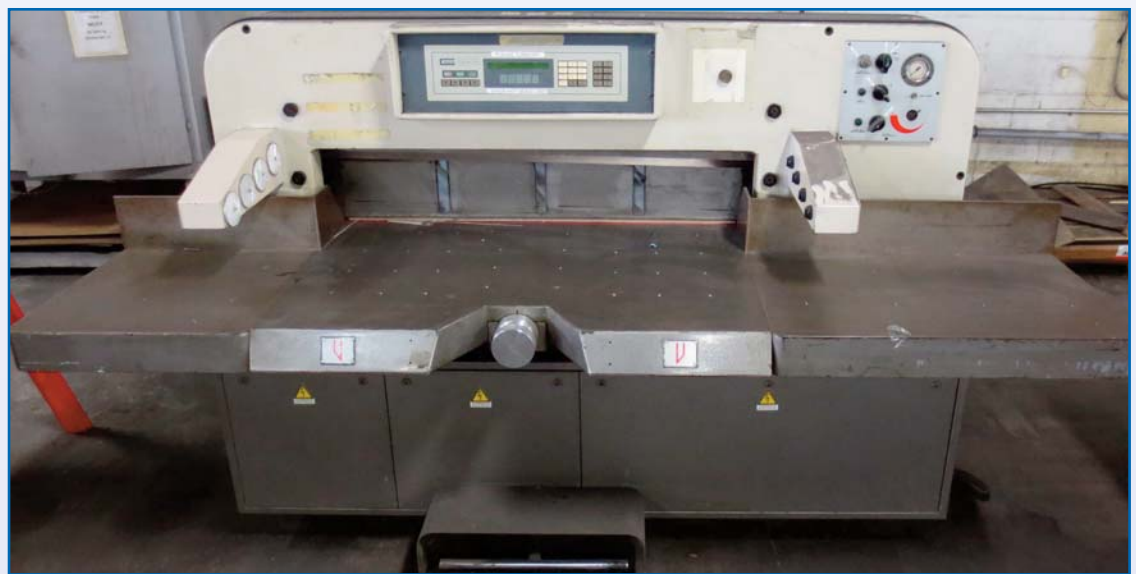
MANDELLI GERGEK 45" PROGRAMMABLE PAPER CUTTER