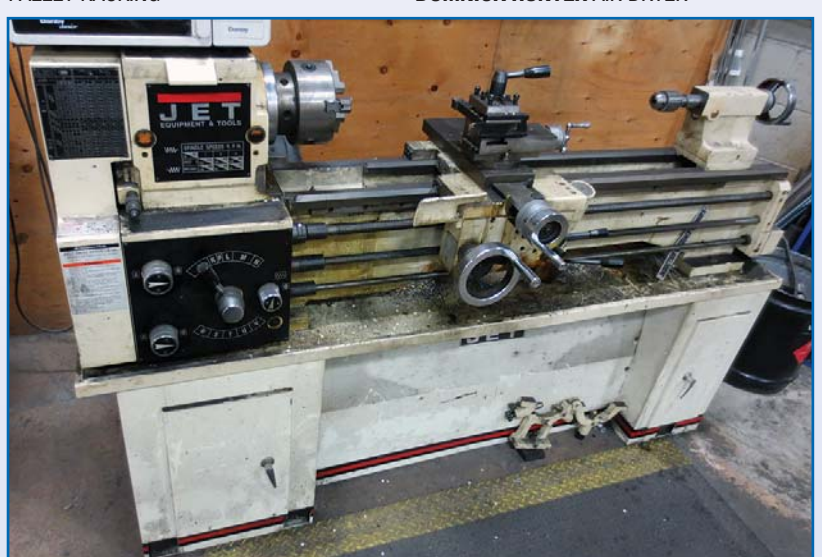
JET TOOL ROOM LATHE